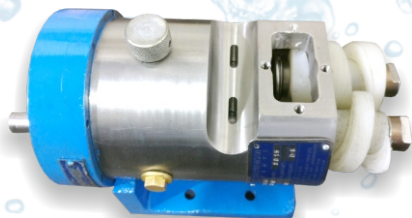
Ideal for Filling Machine